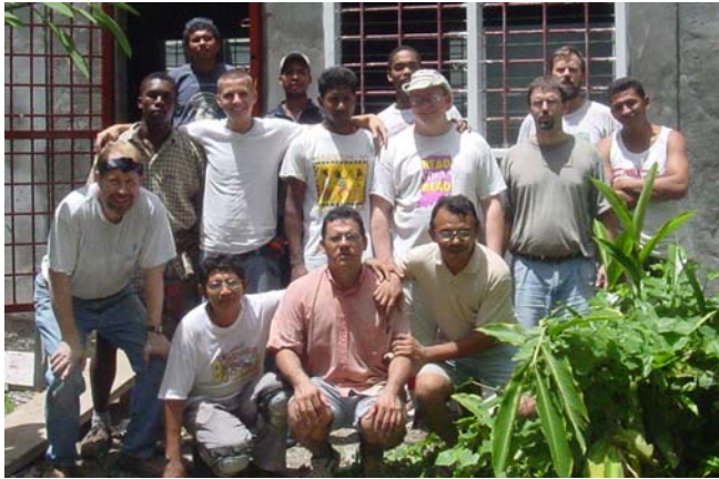
The U.S., Guyana and Brazil Work Team

nothing. One night they did get a ‘not yet’, which was even more baffling to them. I discussed with the pastors the importance of cross-cultural ministering and how sometimes we need to learn new ways of reaching people that do fit with what we might call our ‘cultural norms’.