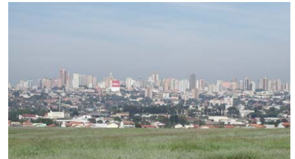
Londrina, Pará - City of 850,000 people